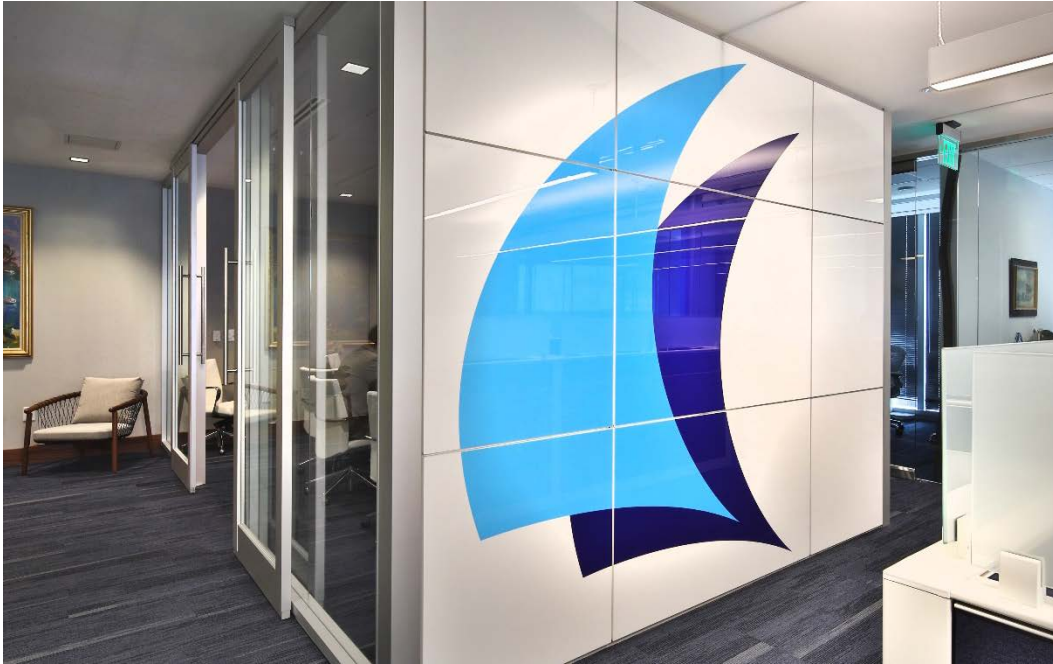
DIRTT's custom graphics are the focal point of this Executive Search company in Raleigh. Project completed by AWC Construction Services in 2017.